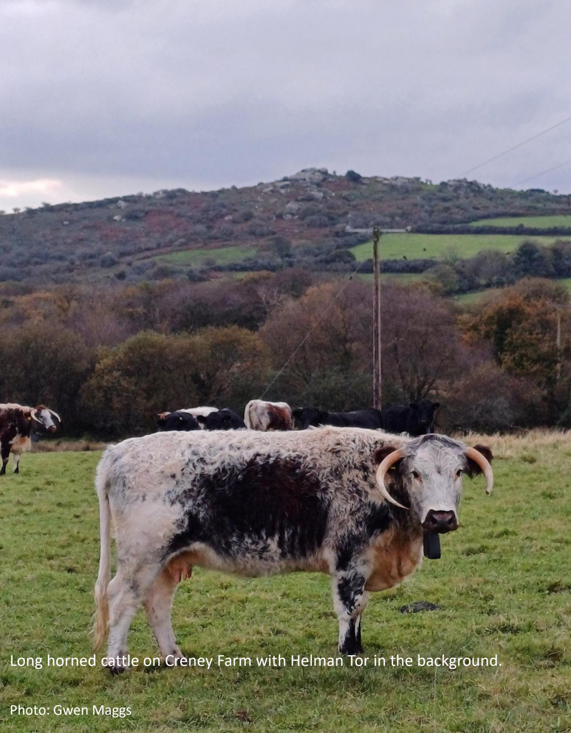
Long horned cattle on Creney Farm with Helman Tor in the background.

Working under the guidance of senior staff and alongside reserve trainees, volunteers, and contractors, the Helman Tor Assistant Reserves Officer will play an important support role in delivering landscape-scale nature recovery and helping to safeguard Cornwall's natural heritage.