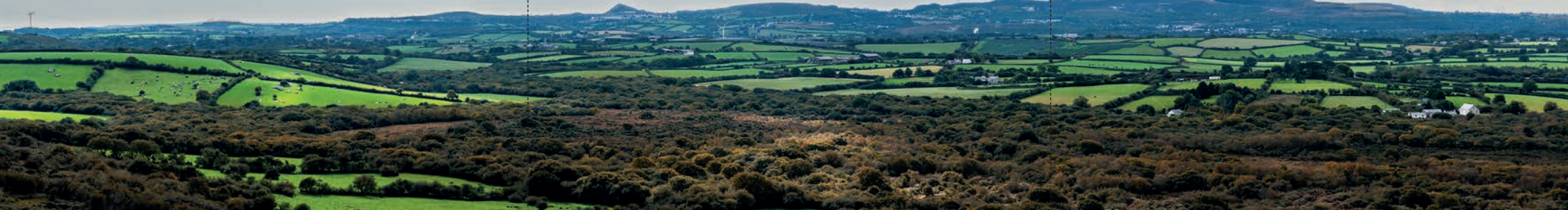
BELOW: panoramic view of the surrounding countryside from the summit of Helman Tor

Containing the remains of a medieval longhouse, Crift is an important site for both archaeology and ecology.