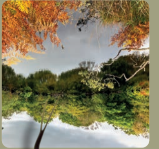
ABOVE: grass snake BELOW: autumn pond at Northern Red Moor BOTTOM: the rare marsh fritillary butterfly

Breney Common is a Special Area of Conservation (SAC), recognised as a site of European importance for wildlife. The mosaic of different types of habitat, particularly the heathland and the areas of wetland, are what make the nature reserve so valuable. Much of the land was mined for tin in the past – an activity that has helped to make the site so rich in wildlife today.