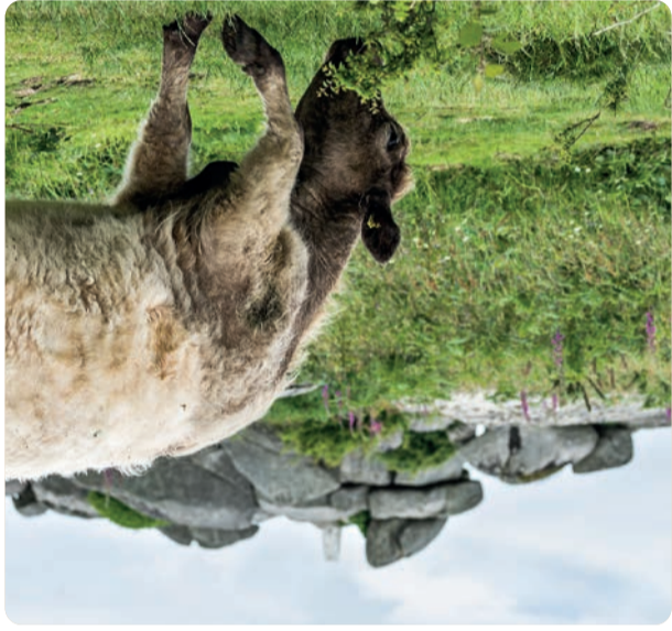
ABOVE: belted Galloway cattle at Helman Tor

Together, we create a Cornwall where nature thrives: