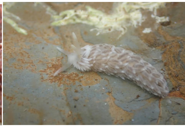
White-ruffed sea slug