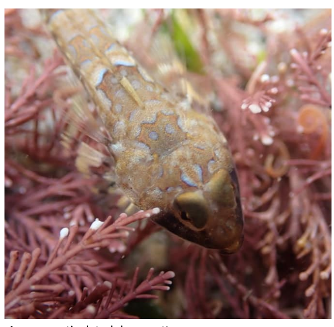
A young reticulated dragonette