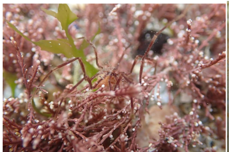
Sea spider carrying eggs