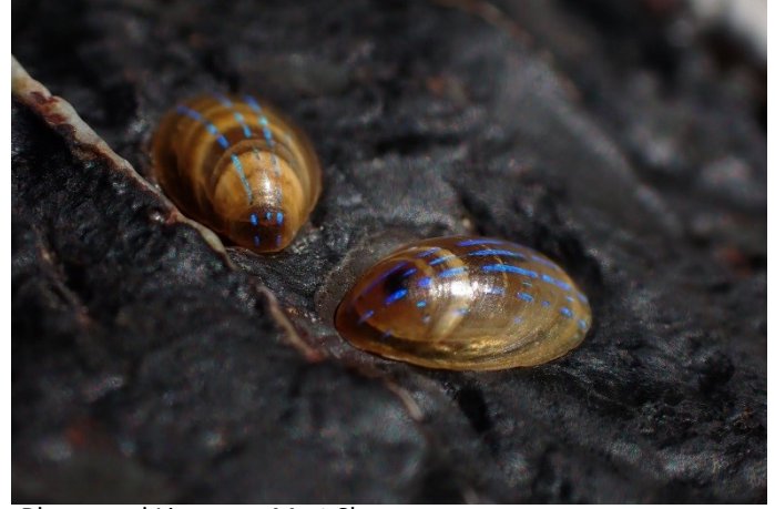
Blue rayed Limpets – Matt Slater