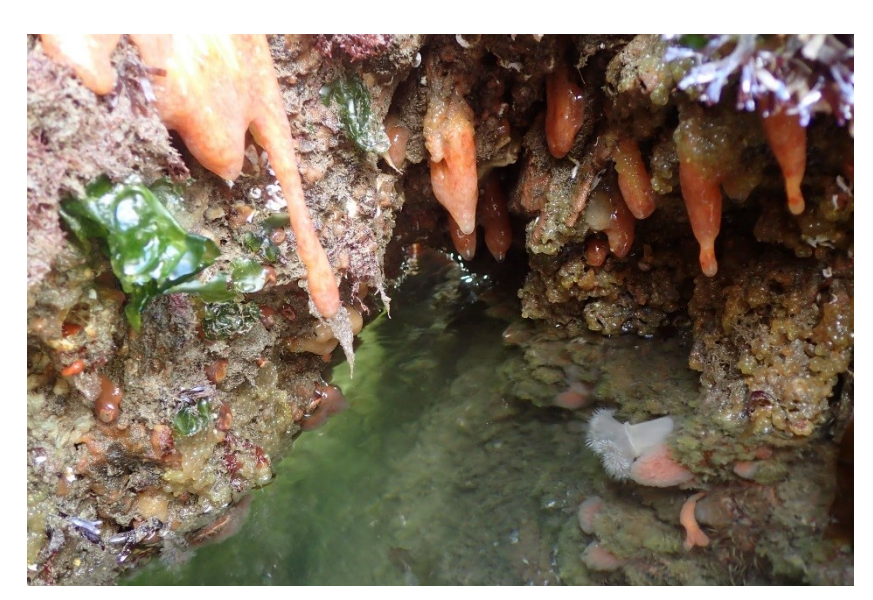
Squirts and anemones galore- Matt Slater

During the two weeks the bioblitz totalled 468 records from 56 different contributors! One of the more colourful finds was of this egg laying pair of nudibranches, Calma glaucoides , as well as the sea squirt cave of wonder at Durgan. Check out the blog post on NMW on the CWT website here