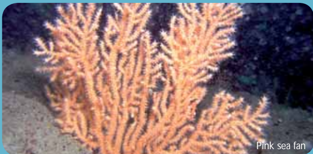
Pink sea fan

The Polzeath VMCA is supported by a strong local group made up of volunteers and related organisations from the area. It also has a unique and special marine centre set in the heart of Polzeath town by the pitch and putt green. Please see www.polzeathmarineconservation.com , search Facebook for 'Polzeath Marine Centre', or email the Your Shore project officer to become part of the local group.