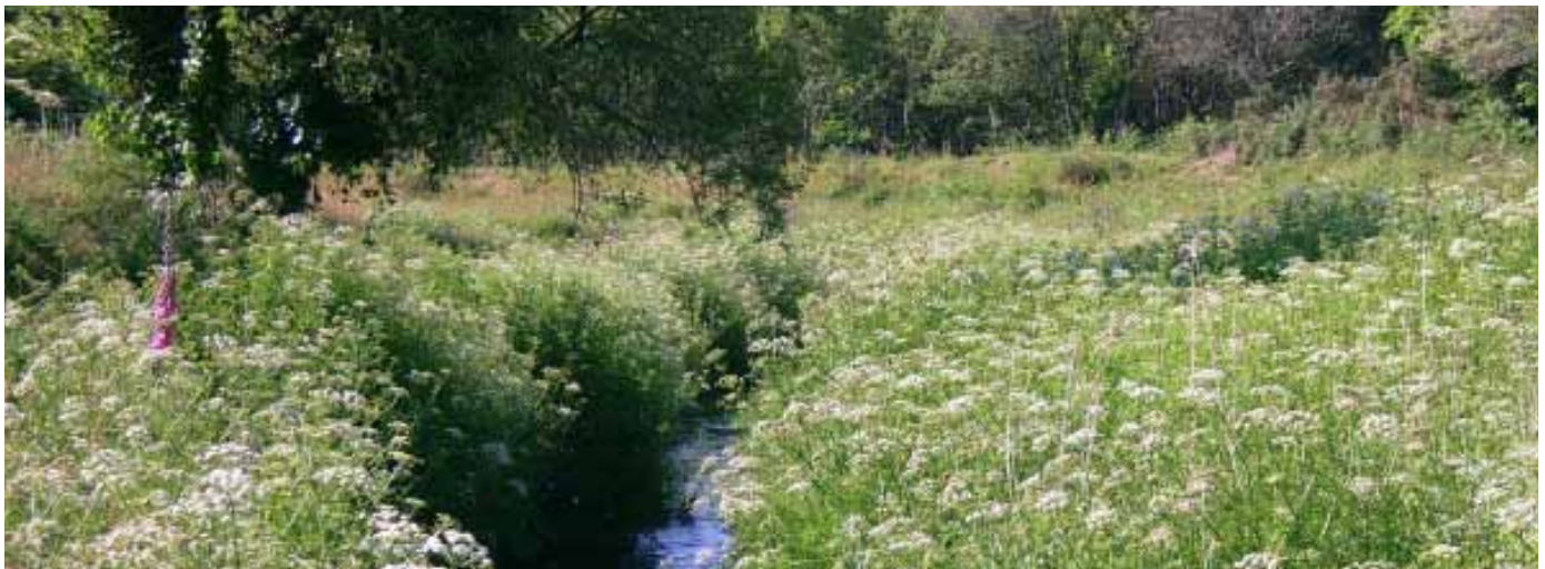
Wetlands are one of our most vulnerable habitats and are still being damaged and lost in Cornwall but you can help us change that.

Wetlands are far more than just habitats for wildlife; they have the potential to soak up flood waters and to slowly release water in times of drought. In a changing climate with potentially hotter, drier summers and more frequent storm events wetlands will be crucial in helping us all to adapt.