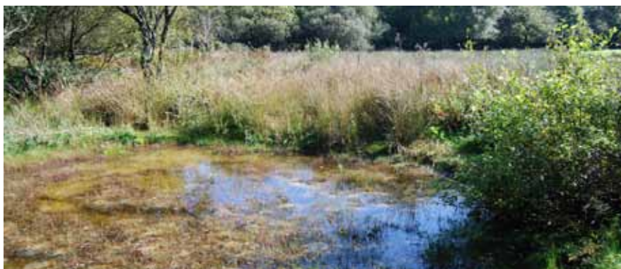
This new pond was created at one of our nature reserves last year and already supports dragonflies, damselflies, water beetles and frogs.

Wetlands are far more than just habitats for wildlife; they have the potential to soak up flood waters and to slowly release water in times of drought. In a changing climate with potentially hotter, drier summers and more frequent storm events wetlands will be crucial in helping us all to adapt.