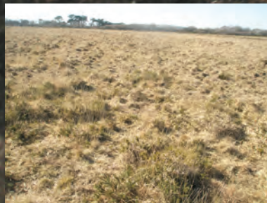
Grazed heathland on nearby Retire Common

We believe that by reintroducing summer grazing with cattle on the sites, better quality, more varied wildlife habitats could be established, leaving the overall character of the Downs virtually unchanged. In order to achieve this we propose the following: