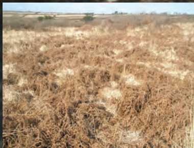
Ungrazed rank grass and bracken on Tregonetha