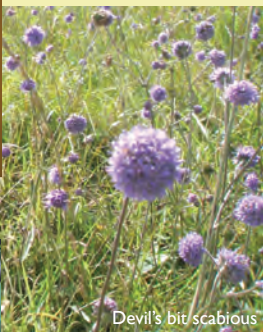
Devil's bit scabious