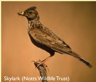
Skylark (Notts Wildlife Trust)

... is a Trust site which has been managed using light grazing and controlled burning. The site is now showing signs of recovery after many years of neglect. Many wildflowers such as Devil's bit scabious are plentiful.