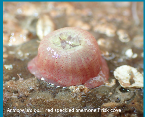
Anthopelura balli , red speckled anemone, Prisk cove