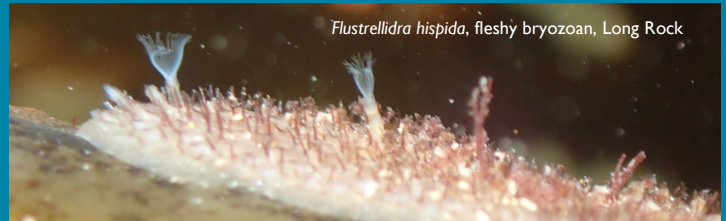
Flustrellidra hispida , fleshy bryozoan, Long Rock