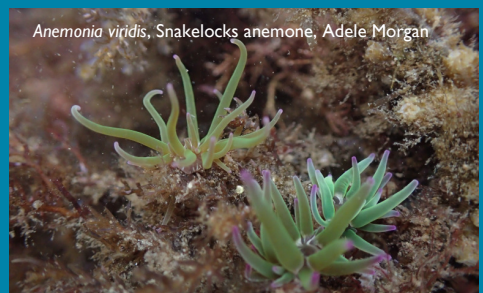
Anemonia viridis, Snakelocks anemone