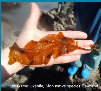
Wakame juvenile, Non native species Cawsand