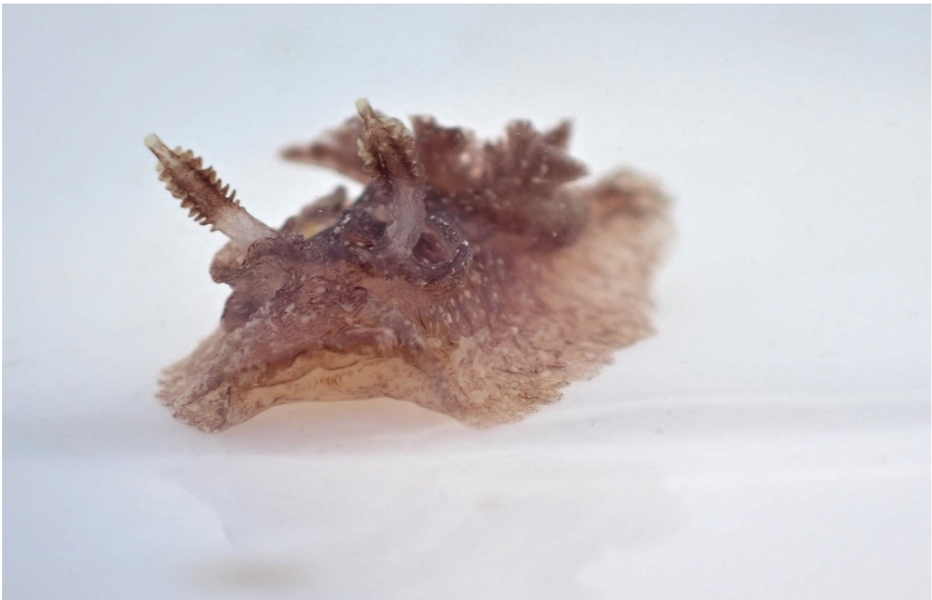
Goniodoris castanea —Matt Slater