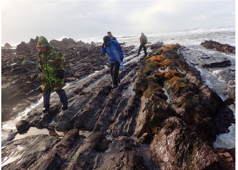
Quadrat training– BMG

At the beginning of year, Bude Marine Group (BMG) had a, very wet, training session on Shoresearch surveying methods. They have now taken this in their stride and have been completing surveys as much as possible when restrictions allow. BMG have managed to complete a massive 4 quadrat surveys, 3 walkover surveys on a total of 7 different beaches. This is a fantastic effort and a big well done to everyone at Bude for smashing out their surveys in 2020. All of their data collected on their surveys has been uploaded to the Shoresearch recording group on ORKS (Online Recording for Kernow & Scilly).