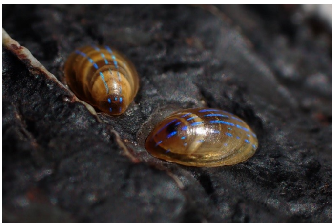
Blue rayed Limpets– Matt Slater

Before the first lockdown we also managed to train up new volunteers at Falmouth on Shoresearch methods and how the whole process works. Afterwards we managed to get out onto the shore and had a great rummage in the pools whilst demonstrating the new skills learnt on quadrat and timed species surveying.