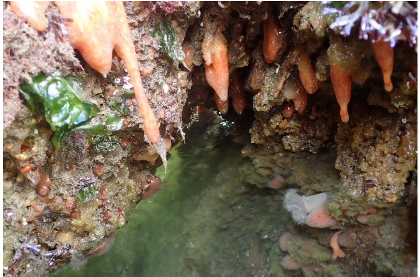
Squirts and anemones galore– Matt Slater

During the two weeks the bioblitz totalled 468 records from 56 different contributors! One of the more colourful finds was of this egg laying pair of nudibranches, Calma glaucoides , as well as the sea squirt cave of wonder at Durgan. Check out the blog post on NMW on the CWT website here